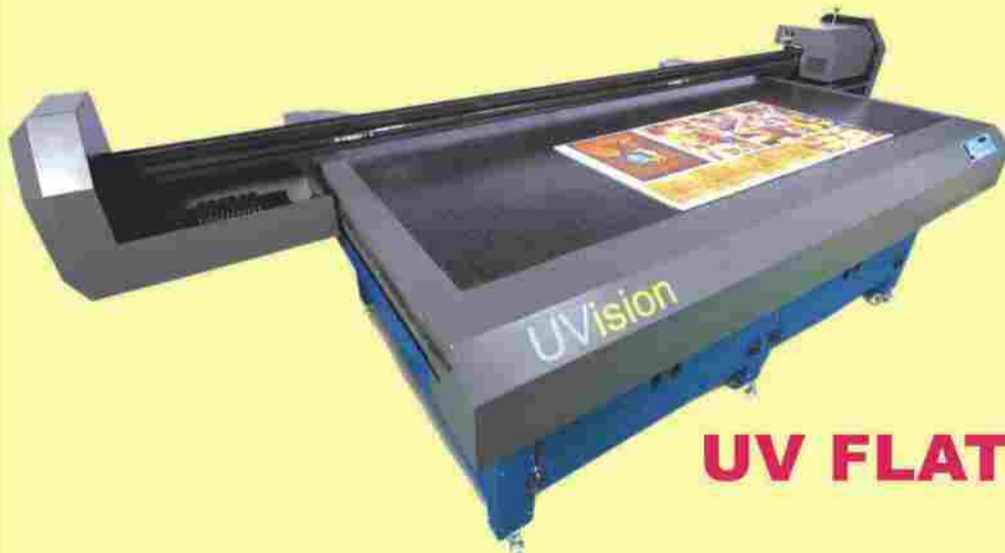
UV FLAT BED