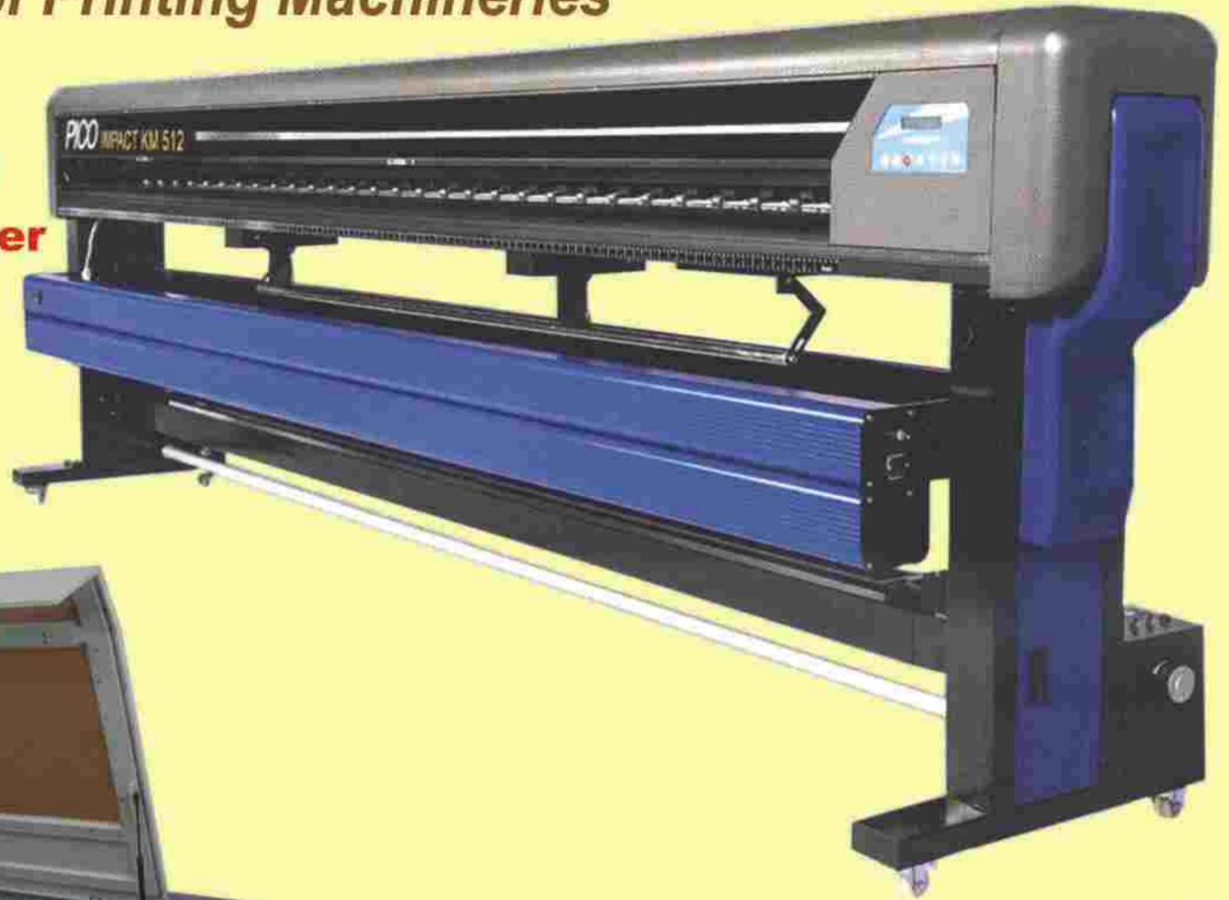
PICOJET Pro Solvent / Flex Printer