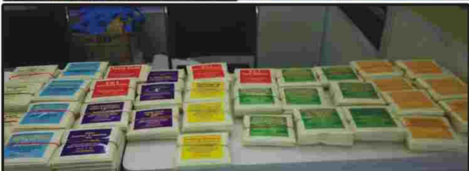
PackPlus South-2018, Hyderabad Exhibition Photos