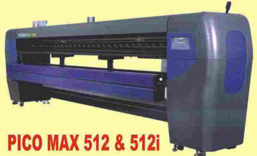
PICO MAX 512 & 512i Solvent / Flex Printer