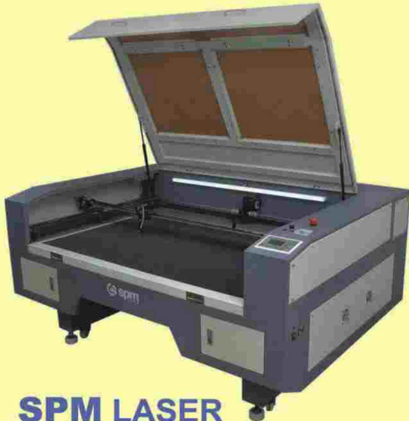
SPM LASER ENGRAVER & ROUTER