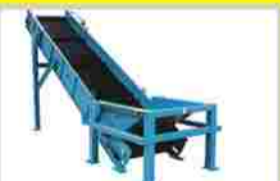
GREEN CATERPILLAR BELTS