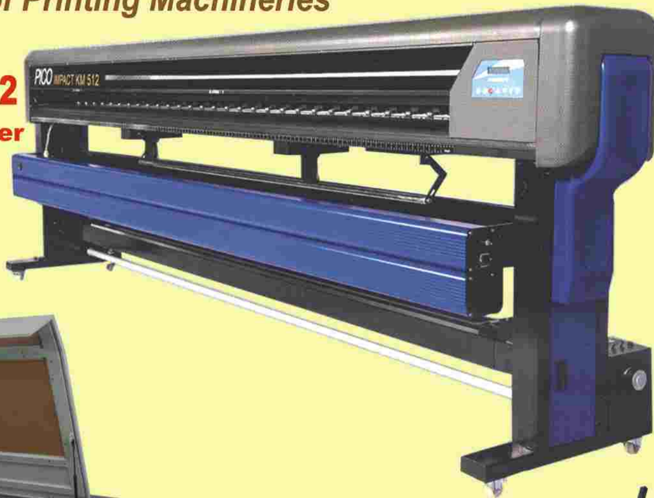
PICOJET Pro-512 Solvent / Flex Printer