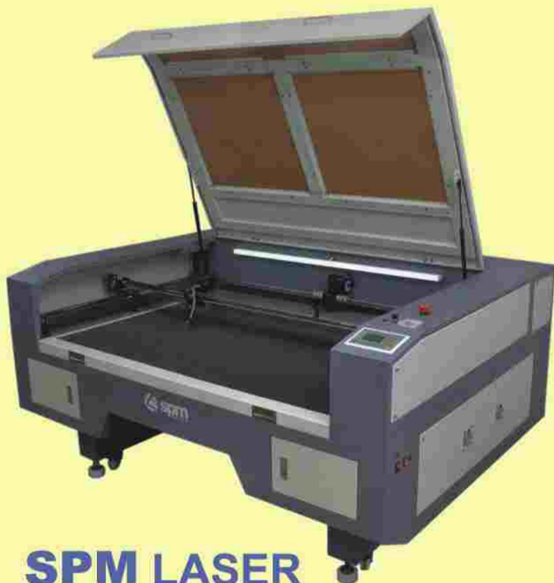
SPM LASER ENGRAVER & ROUTER