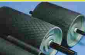
BELT CONVEYOR PULLEYS