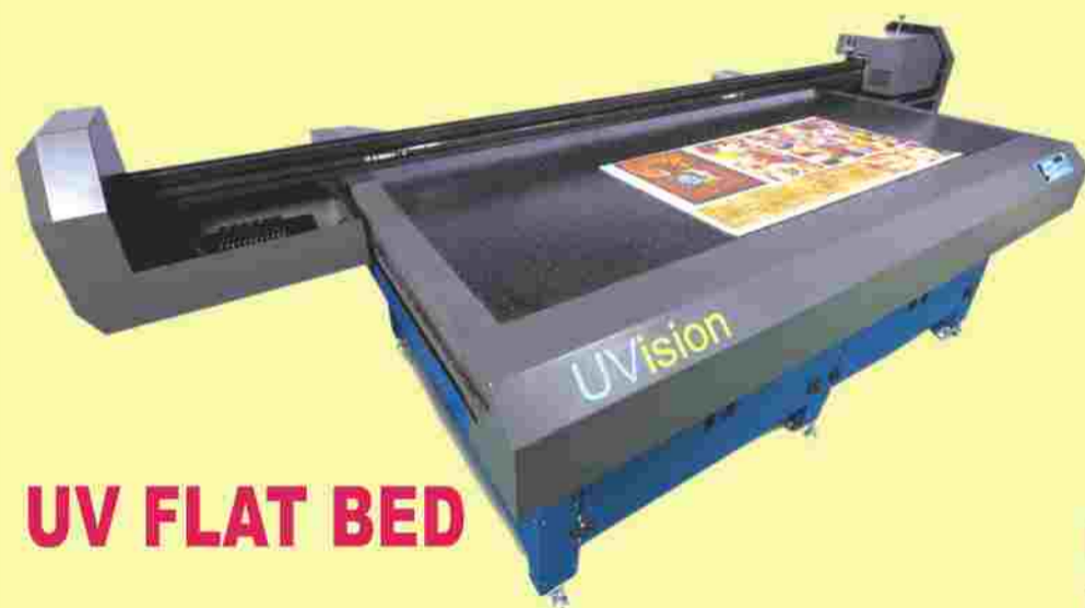
UV FLAT BED