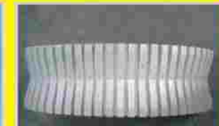
TAKE UP BELTS