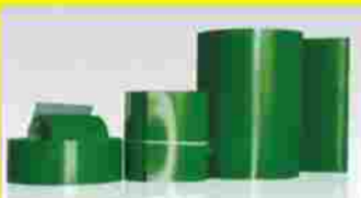
PVC & PU CONVEYOR BELTS