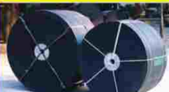
RUBBER CONVEYOR BELTS