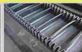
SPECIAL CONVEYOR BELT