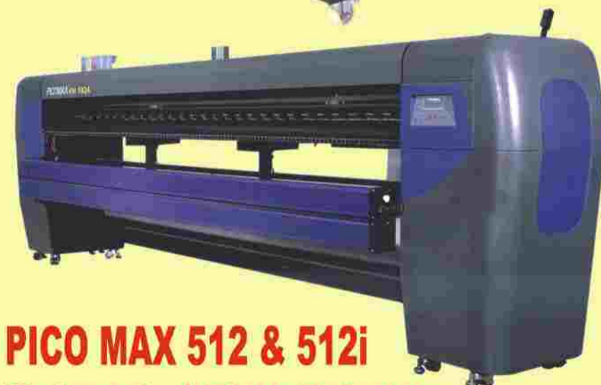
PICO MAX 512 & 512i Solvent / Flex Printer