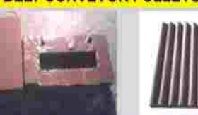
STONE CRUSHER SPARES