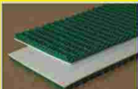
ROUGH TOP BELTS