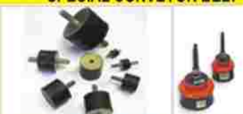
ANTI VIBRATION PADS