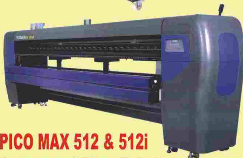
PICO MAX 512 & 512i Solvent / Flex Printer