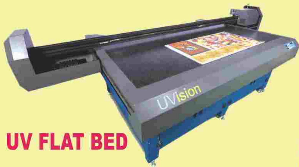
UV FLAT BED